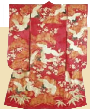
Young women's formal kimono (uchikake) Late Meiji Period, 1880s–1890s Handspun pongee silk (tsumugi), plain weave, Hand painted, rice-paste resist outlining (yuzen); woodblock printed; couched gold and silk thread embroidery The Montgomery Collection, Lugano Switzerland