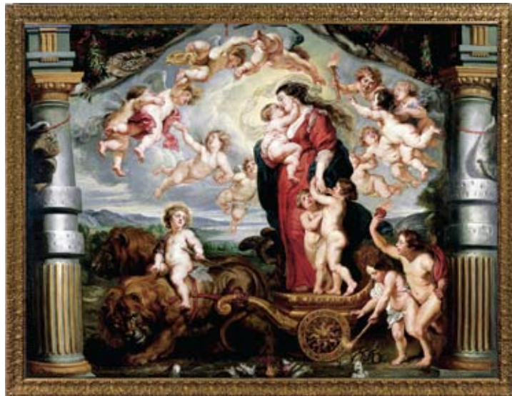
Peter Paul Rubens The Triumph of Divine Love , c. 1625 Oil on canvas Museum purchase, 1980, SN977