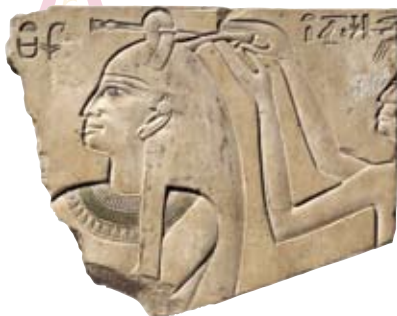
Sunk Relief of Queen Neferu ca. 2008 B.C.-1957 B.C. Limestone, painted 7 1/2 x 9 5/16 x 3/4 in. (19 x 23.6 x 1.9 cm) Charles Edwin Wilbour Fund

Join us for engaging programs that enhance your understanding and appreciation of the Museum's permanent collection and special exhibitions.