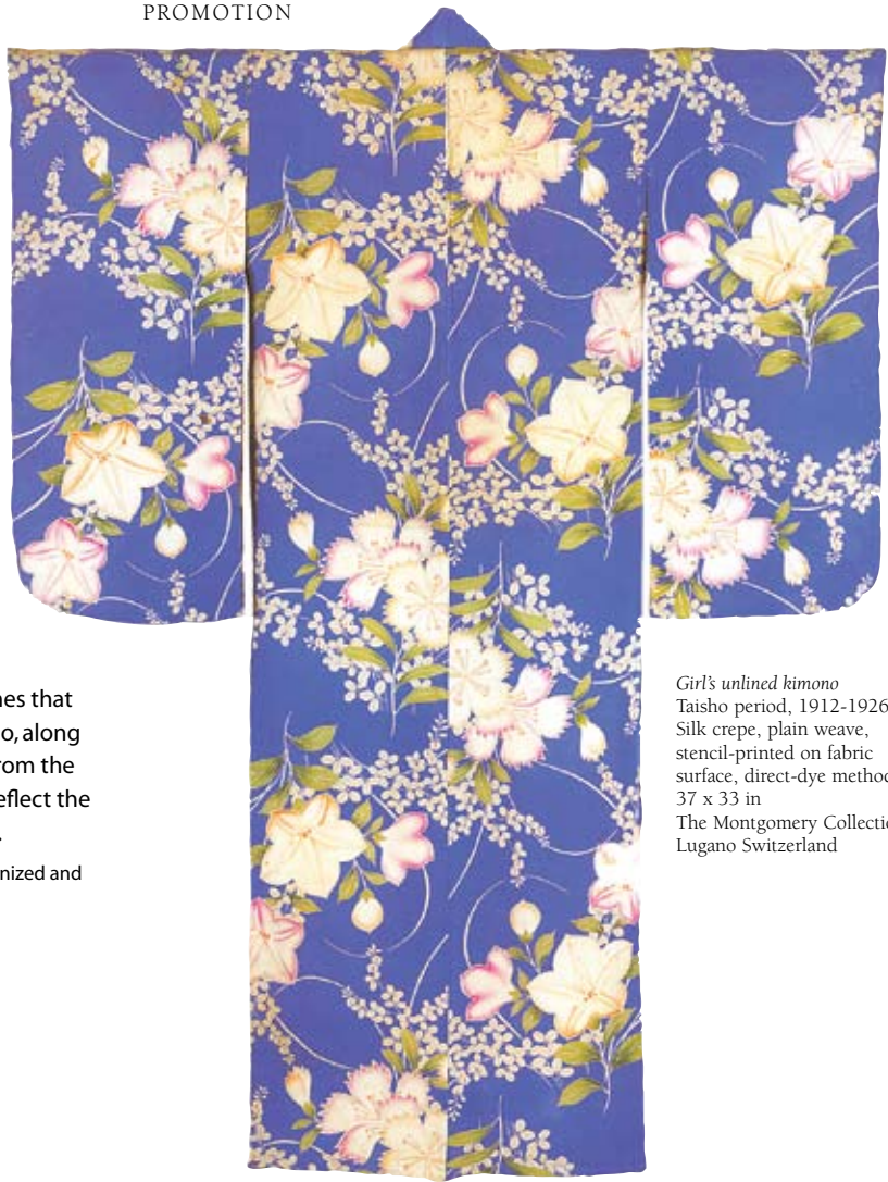
Girl's unlined kimono Taisho period, 1912-1926 Silk crepe, plain weave, stencil-printed on fabric surface, direct-dye method 37 x 33 in The Montgomery Collection, Lugano Switzerland

Fashioning Kimono: Art Deco and Modernism in Japan is organized and circulated by Art Services International, Alexandria, Virginia.