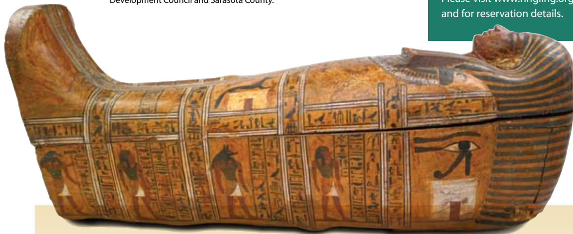
Anthropoid Coffin of the Servant of the Great Place, Teti New Kingdom, Dynasty 18, ca. 1339 B.C. - 1307 B.C. Wood, painted. Place purchased: Thebes, Egypt, Africa. Charles Edwin Wilbour Fund

Thank you also to the Sarasota County Arts Council, Tourist Development Council and Sarasota County.