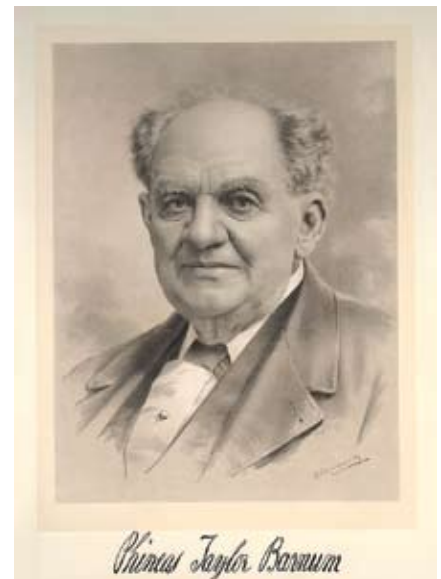
Unknown printer, circa 1888 Phineas T. Barnum poster Tibbals Digital Collection

Fee: $310 / $265 Ringling Members – Includes ticket to performance of Barnum !